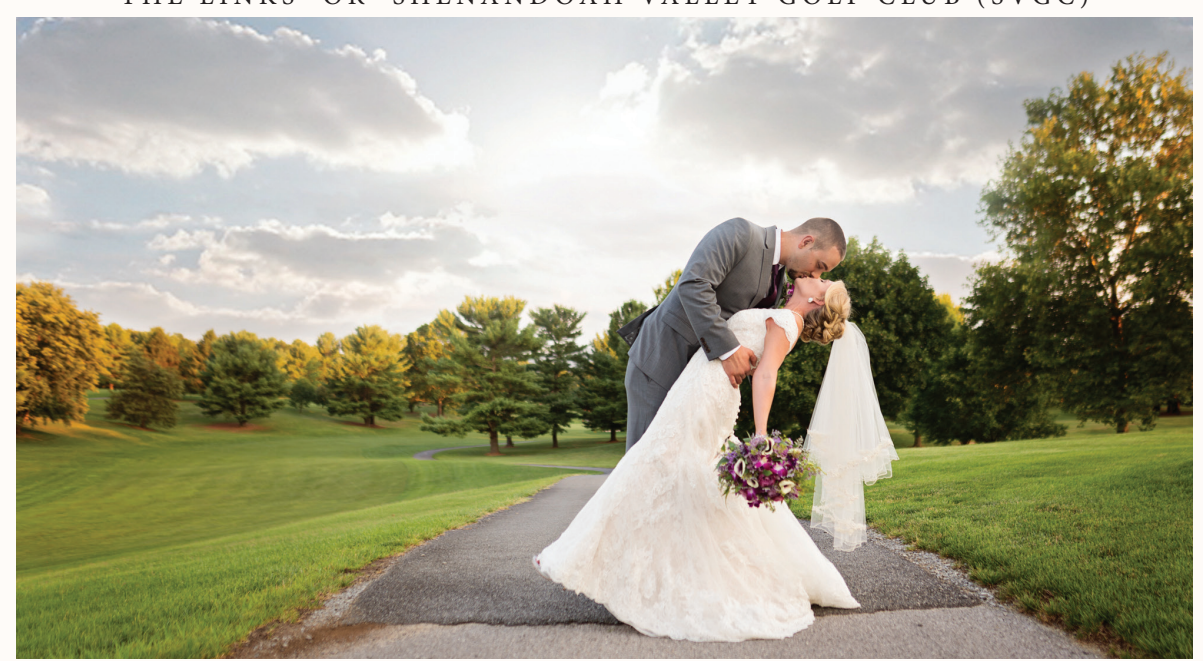
THE LINKS OR SHENANDOAH VALLEY GOLF CLUB (SVGC)